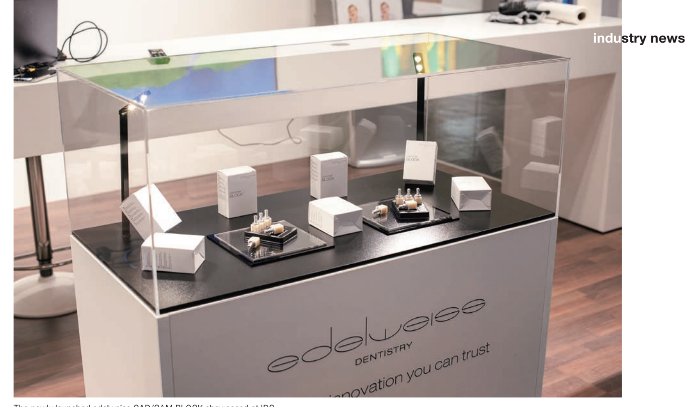
The newly launched edelweiss CAD/CAM BLOCK showcased at IDS.

making it easy to restore implants especially in the case of immediate loading or custom abutments. The block has a unique shock-absorbing effect. Resin within the material gives the restoration the resilience to withstand any occlusal force. This is particularly important to avoid transmission of forces to the periodontal tissue and the implant, making the edelweiss i-BLOCK a safe option for long-lasting protection of the implant.