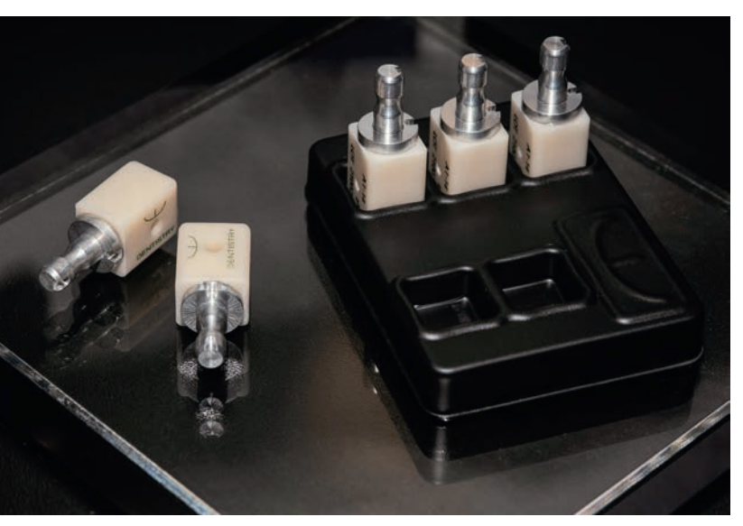
The edelweiss i-BLOCK with integrated screw channel.

By Franziska Beier, Dental Tribune International