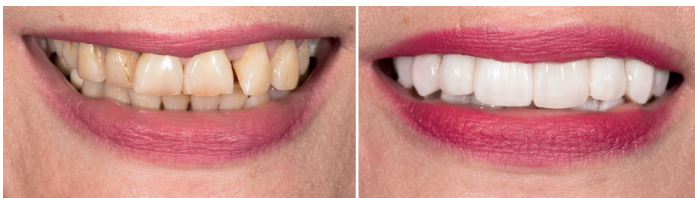
edelweiss discoloured / shortened teeth case