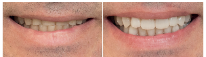
edelweiss full mouth rehabilitation case